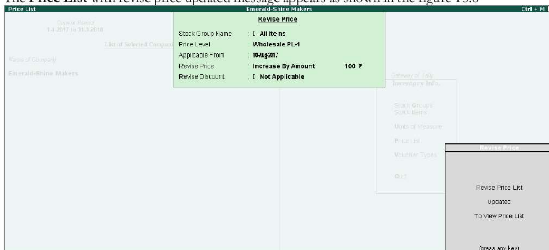
Figure 13.6 Revision Price Message Popup

The Price List with revise price updated message appears as shown in the figure 13.6