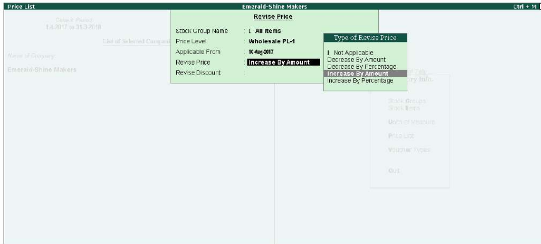
Figure 13.5 Revision of Price List Screen